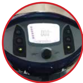
New Anti Glare LCD Screen