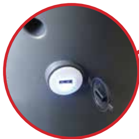
Handy USB fitting