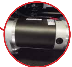
Powerful 4 Pole Motor