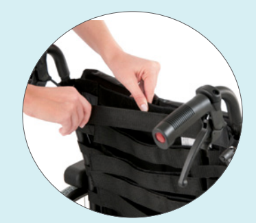
Tension adjustable backrest from 41cm to 46 cm.