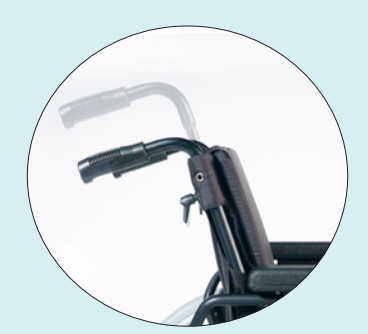
Height adjustable push handles