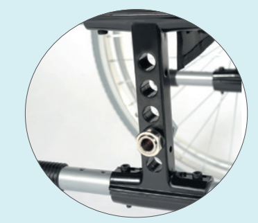
Frame Design includes seat depth adjustability (41 to 46 cm).